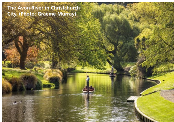
The Avon River in Christchurch City.

For further information and to register, go to www.rotaryoceania.zone/page/rotaryzone8conference .