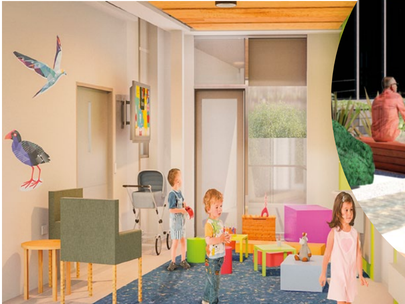
An artist's impression of the planned play area in the children's ward of Grey Base Hospital and Integrated Family Health Centre.