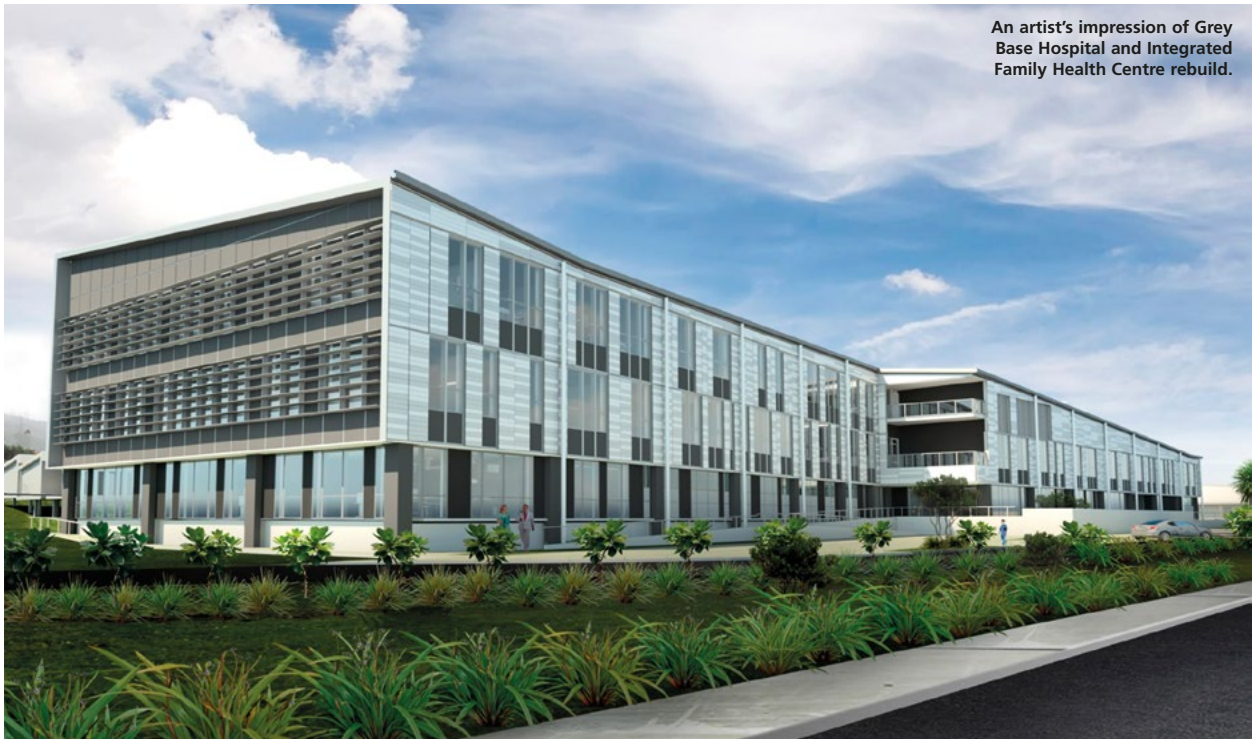
An artist's impression of Grey Base Hospital and Integrated Family Health Centre rebuild.

As Rotary seeks to modernise and become more relevant, it should be alert to opportunities to partner with community organisations and corporates, as together we can make a much bigger impact than we could alone. Our collaborative effort is certainly producing wonderful results in Greymouth. •